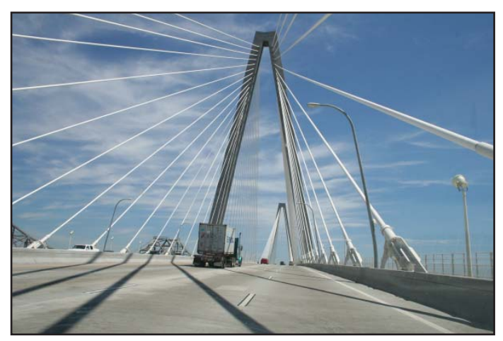
The Arthur Ravenel, Jr. Bridge

The first bridge to cross the lower Cooper River near Charleston opened in 1929. The main span (the section of the bridge between the two main supports) of the double cantilever truss bridge was the fifth longest in the world at 320 m and soared 46 m above the river. Its main span was the twelfthlongest in the world. The total length of the structure was about 4.3 km. Following a 17-month construction period at a cost of US$6 million, and using 41,000 tonnes of steel, it opened on 8 August 1929.